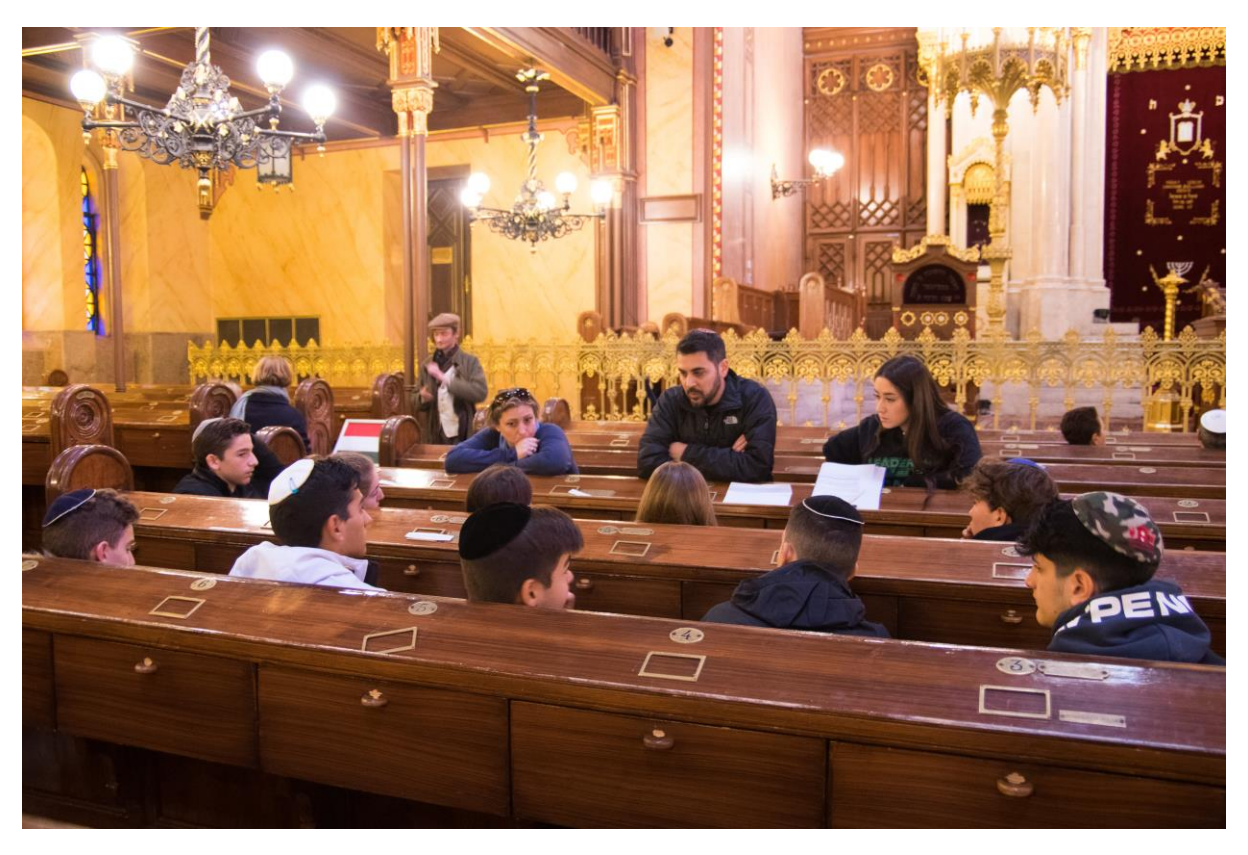
Zionism discussion at Dohany Synagogue

I thought that the trip really highlighted the amazing Jewish community and culture thriving within Budapest. I really thought that we all got to know each other more and learn about Maccabi and it's connections around the world. I developed inter personal skills when meeting the other young Hungarian Jews at the ICI and over meal times with the group.