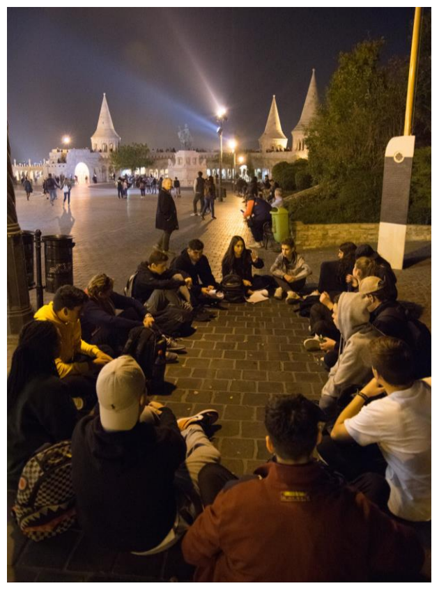
Teamwork discussion at Fisherman's Bastion