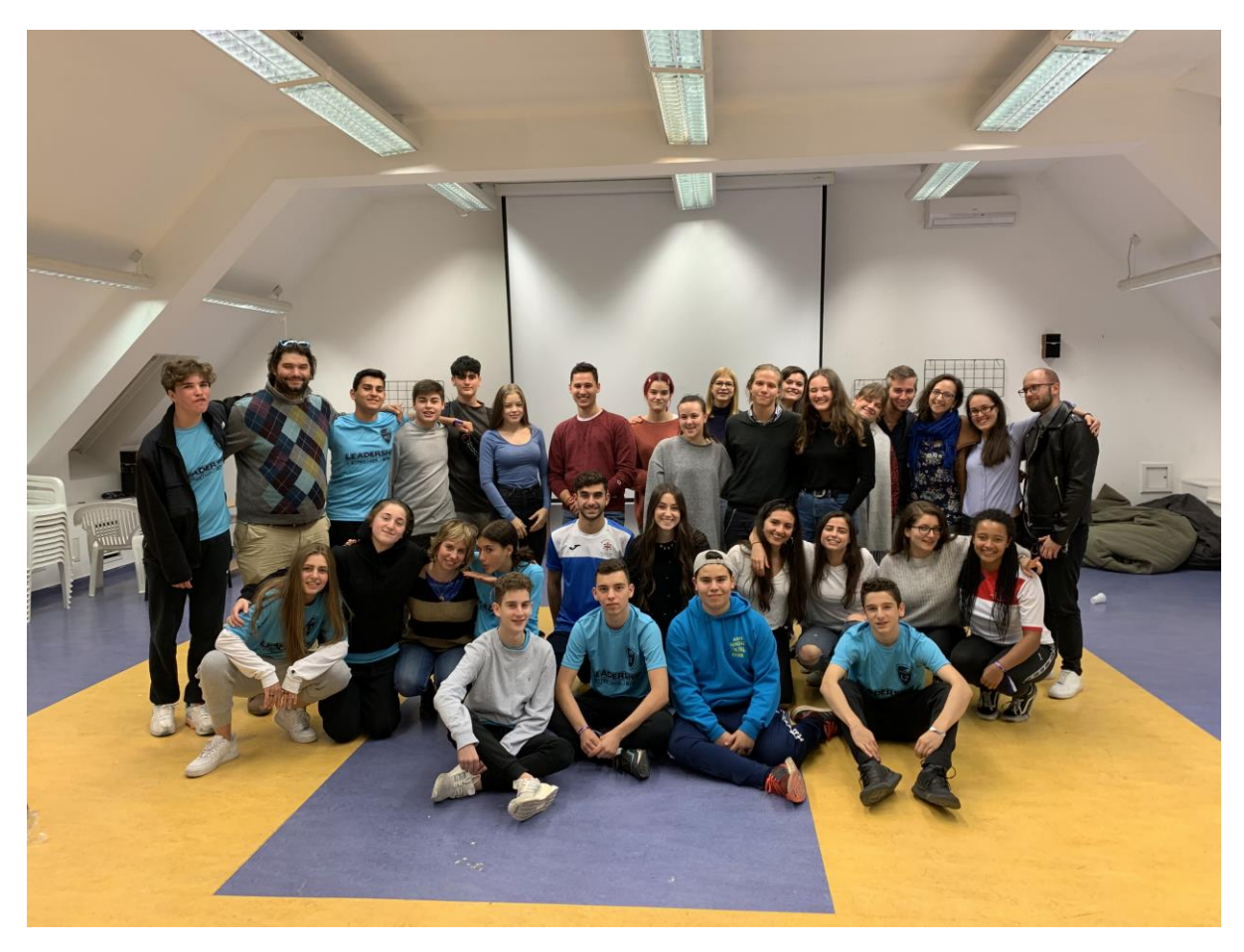
Maccabi GB & Maccabi vac Hungary at the Israeli Cultural Institute

The atmosphere was beyond incredible and I really felt the leaders and the group mixed incredibly with everyone becoming close friends as if we had been on the trip for months not only 2 days. We visited gorgeous monuments, one that stood out for me was the Dohany synagogue, which really blew me away and shocked me at its amazing infrastructure. I would say it was a once in a lifetime experience that should be allowed and open to every Jewish kid.